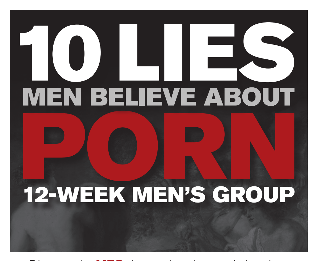
Discover the LIES that are keeping you in bondage, and the TRUTH that will set you free.